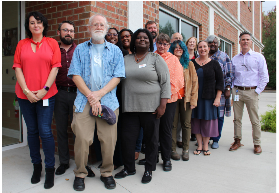
ABCLT board members and supporters meet regularly at Pisgah Legal's Asheville office.