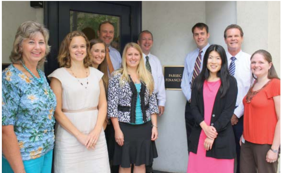
Members of the Parsec team, outside their downtown Asheville office on Wall Street.