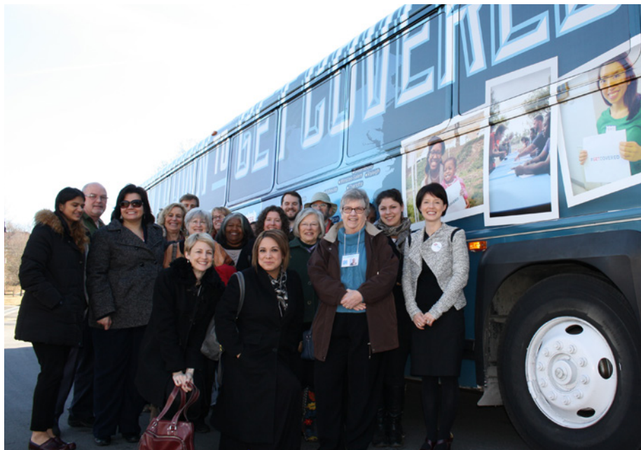
ACA volunteers and staff are pictured here with the "Get Covered America" bus that rolled into Asheville on February 3rd.

For open enrollment between November 2014 and February 2015, Navigator volunteers helped Pisgah Legal Services make over 1,000 consumer appointments in 20 different locations around WNC in both Spanish and English. They logged over 2,500 hours of volunteer time in offering navigation appointments, plus over 100 hours of volunteer time in outreach activities to spread the word to hard-to-reach populations. Navigators were on hand to help mornings, afternoons, evenings, weekends and holidays.